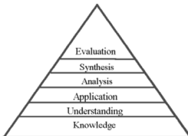
Figure 1: Bloom's Taxonomy of Student Learning

Considering Bloom's hierarchy of Fig. 1, any educational organization should stress more on problem- and project-based learning. It is well understood that academic staff who are in direct touch with students can better design the curriculum and related instructional strategies. The academic staffs are responsible for maintaining the vibrant curriculum. Benjamin Bloom headed a group of educational psychologists who developed a classification of levels of intellectual behaviour important in learning. Bloom found that over 95 % of the test questions that students encounter require them to think only at the lowest possible level—the recall of information. Bloom's six levels of Figure 1 within the cognitive domain span from the simple recall or recognition of facts, as the lowest level, through increasingly more complex and abstract mental levels, to the highest order which is classified as evaluation. Engineering curriculum based on OBE must develop students to embrace the top five levels other than just the knowledge delivery and recall.