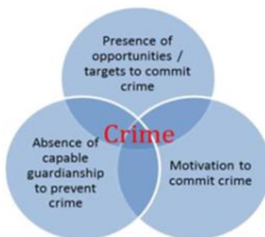
Figure 2. Routine Activity Theory in Crime

This opportunity crime theory is also known as routine activity theory. Cohen and Felson (1979) showed that structural changes in routine activity patterns can influence crime rates because of the inclusion of the following three elements as shown in the Figure 2: (1) motivation to commit crime, (2) presence of opportunities/targets to commit crime, and (3) the absence of capable guardianship to prevent crime.